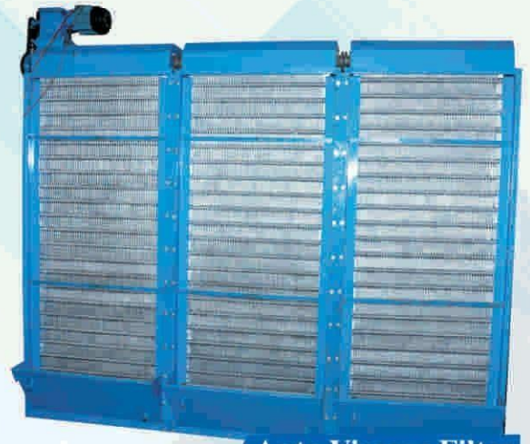
Auto Viscous Filter

Space Ventilation Systems will strive towards eliminating quality losses to the society by continuously implementing new technology and providing value added services in field of Air Solutions.